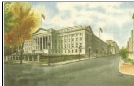
Spring view of South Façade of Main Treasury

THA purchased one of these paintings and donated it to the Treasury Department, but first used it to create note cards and lithographs for fundraising. The wife of then-Secretary Brady purchased the other one and permitted THA to use it to make note cards.