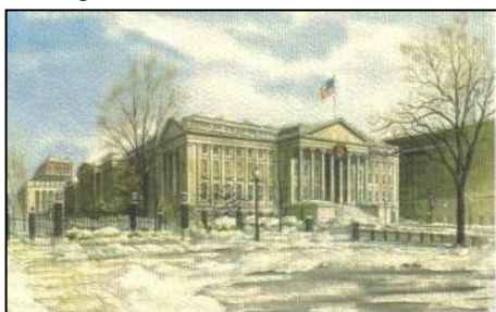
Winter view of South Façade of Main Treasury