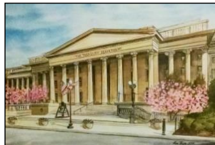
Watercolor painting of the Bell Entrance to Main Treasury

Ken's most recent Treasury painting was for TDRA, capturing the West façade of the building with its flowering trees. He also produced lithographs as sale products for this organization.