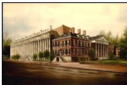
Northeast view of Mills wing before the old State Department Building was torn down to allow completion of the Main Treasury Building.

Ken later produced paintings of all the historically-restored rooms in the building, which THA also donated to Treasury. For the 150 th anniversary of the oldest wing of the Treasury Building in 1992, Ken created a painting of the Mills wing from a c.1865 photograph.